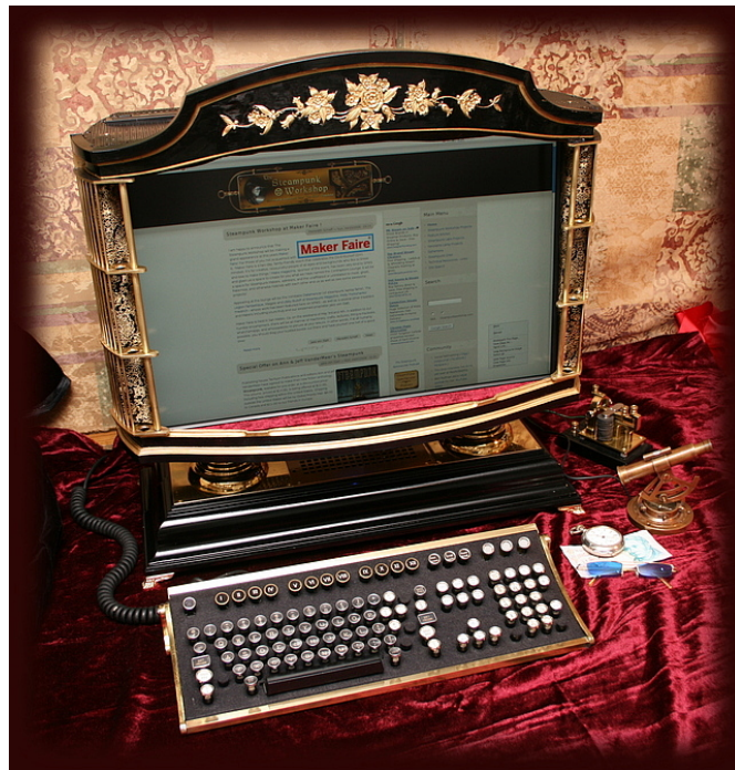
Figure 4. Jake Von Slatt's Victorian All-in-One PC

If we consider the internal pieces of a machine to be the guts, the internal organs, of a machine, then it is only reasonable to look at other pieces as body parts as well. “Gluing gears” on an object to make it steampunk does not create a new, lasting body, it instead creates a body that will quickly become null or lose its grotesque nature.