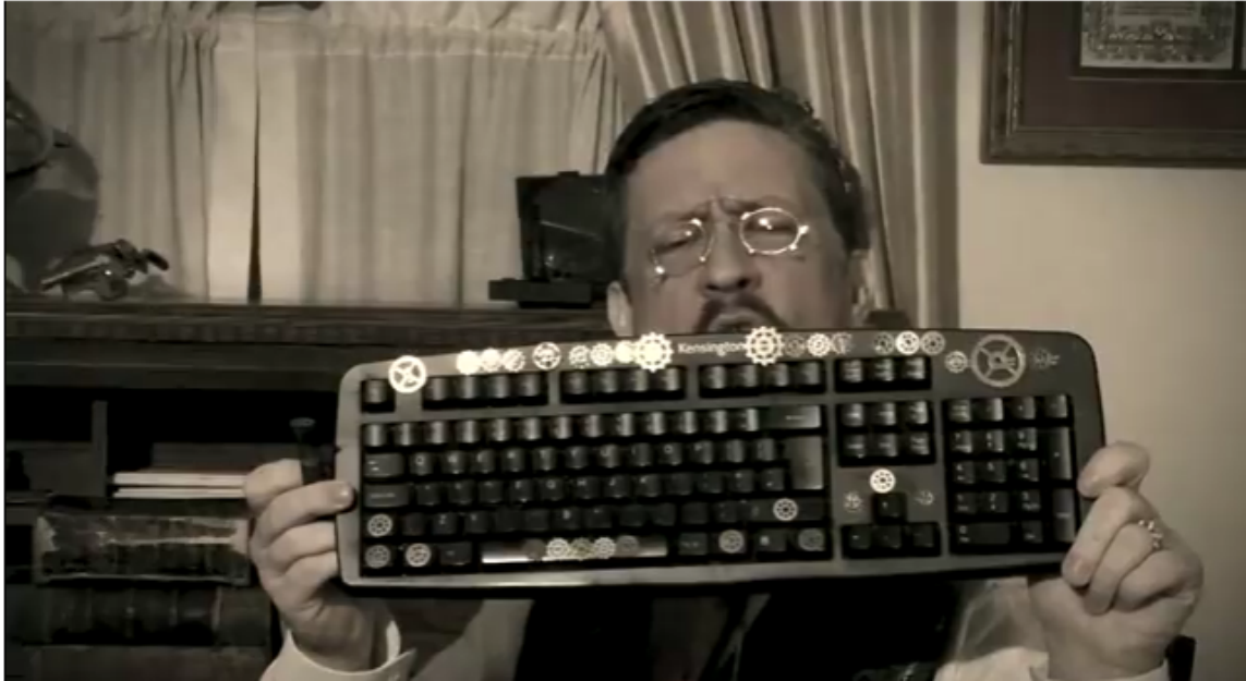
Figure 3. Sir Reginald Pikedevant Displays a Gear Covered Keyboard

The steampunk community uses the phrase "glue some gears on it and call it steampunk" as a way to mock those who appropriate the steampunk sub-genre for their own financial gain.