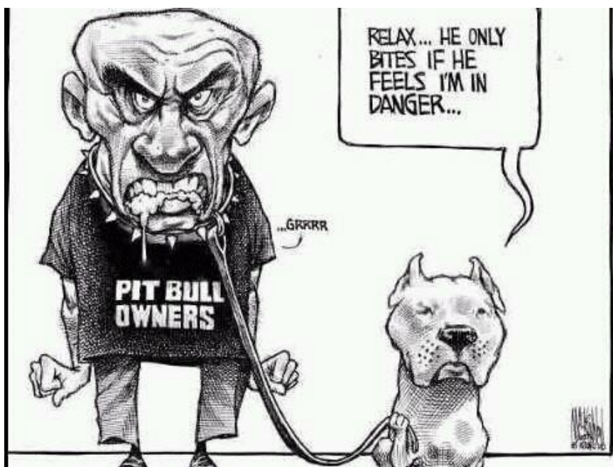
Figure 1 Pit Bull Owner Cartoon

While owners fall short of saying that they will bite someone who gets between them and their dogs, they are quick to assert that they carefully weigh their options in human relationships to prioritize their dog. One owner reported: