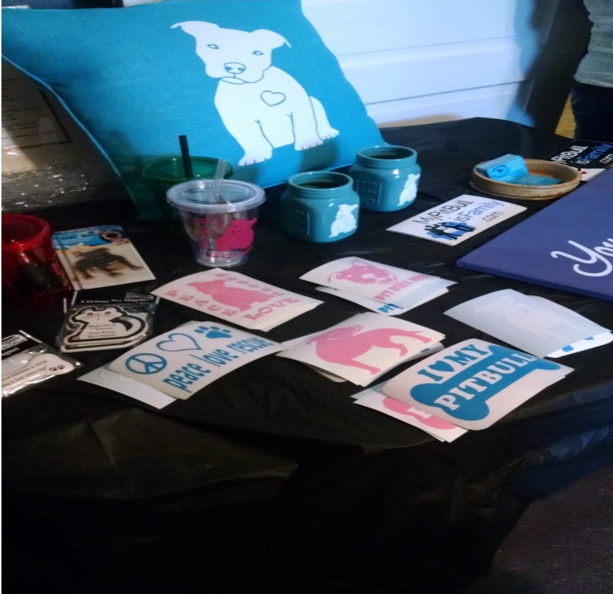
Figure 2 Pit Bull Merchandise