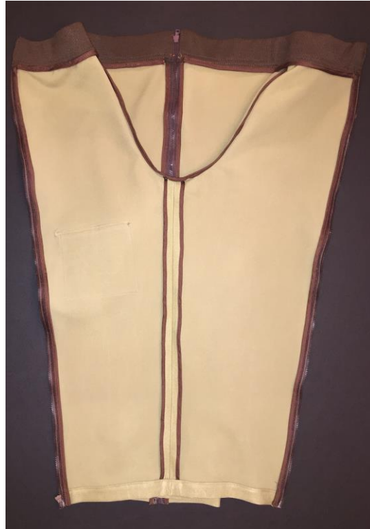
Figure 8. Pant Side Unzipped