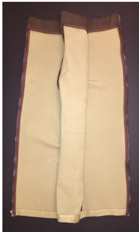
Figure 13. Step Two