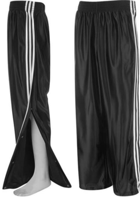
Figure 2. Polyester Snap Pants Image from Adidas.com

I learned that Figure 1. was favorable because of its soft, elastic, stretchy waist and comfortable, 100% cotton fabric. The elastic waistband made it easier to pull the pants on the waist. The pants were also favorable because of their versatility and because they could be worn with almost any casual shirt and even button down dress shirt and penny loafers. The unfavorable traits of these pants were their back pockets, high front waist and low back waist, and the pant legs. Although the back pockets were thin because of the fabric, the back pockets could still be felt while seated which caused some discomfort. High socks also had to be worn with these pants to ensure that the lower leg portion would not be exposed while seated in the wheelchair.