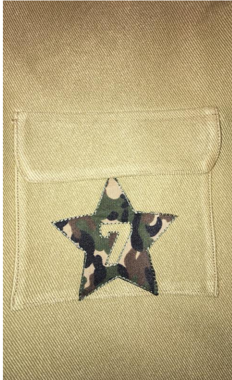
Figure 10. Pocket Details