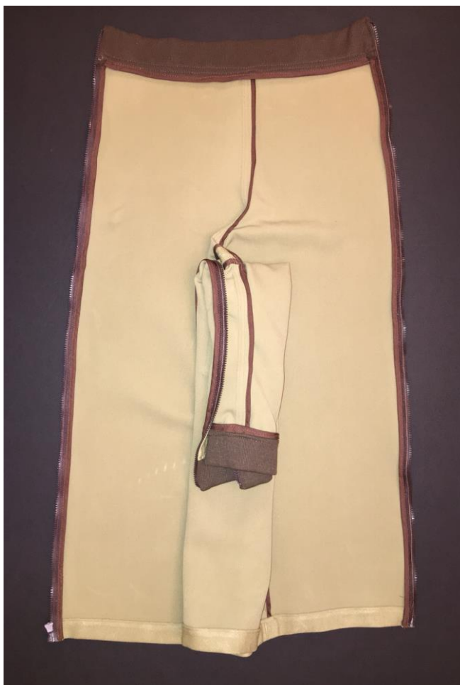
Figure 14. Step Three

After the pants are unzipped and separated on both sides, each front pant leg should be rolled towards the inseam of the pants, creating one roll in the front center of the pants. This step is shown in Figure 13. Lastly, the top front of the pants should be folded down towards the center of the pants. This step is shown in Figure 14.