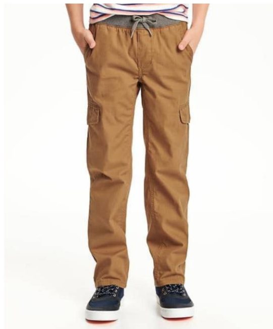
Figure 1. Cargo Pants Image from OldNavy.com

During my interview with Hayden, I was shown two pair of his favorite pants. Two prominent styles that were shown are in Figure 1. and Figure 2.