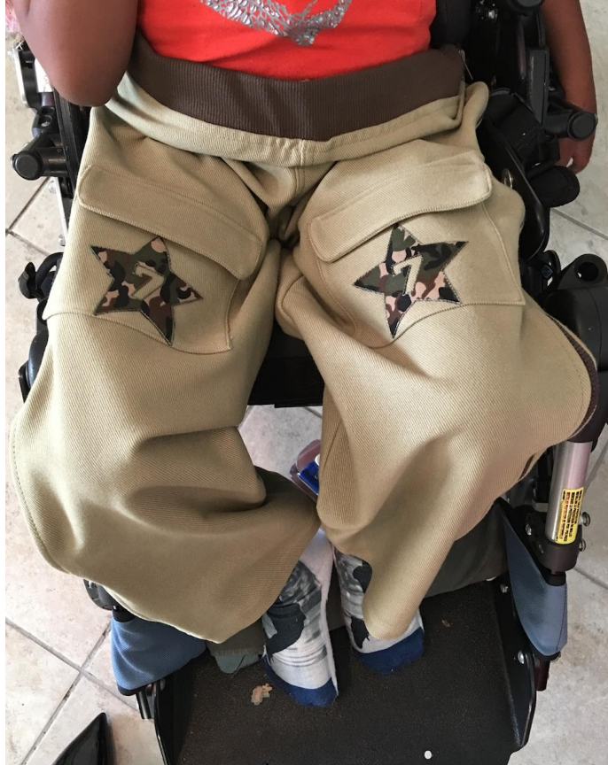
Figure 11. Garment on a Child