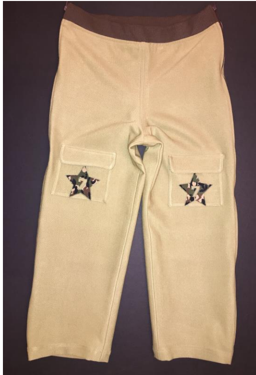
Figure 4. Pant Front