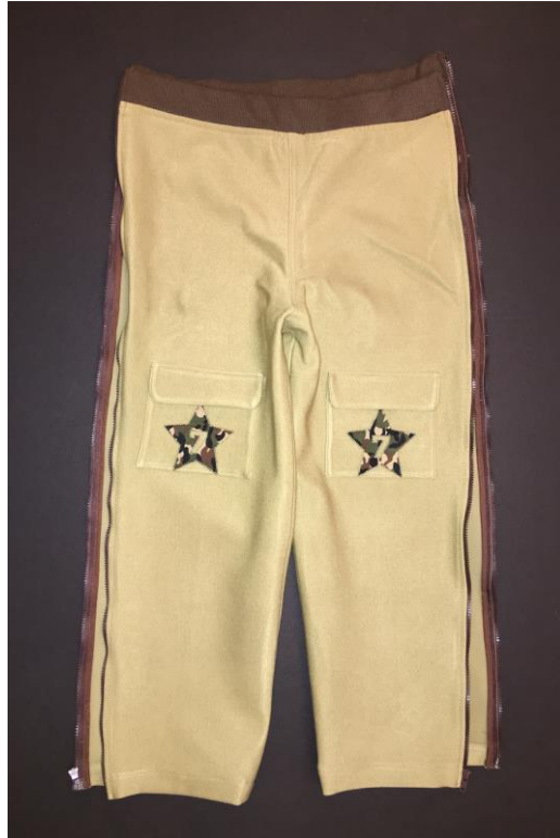
Figure 12. Step One