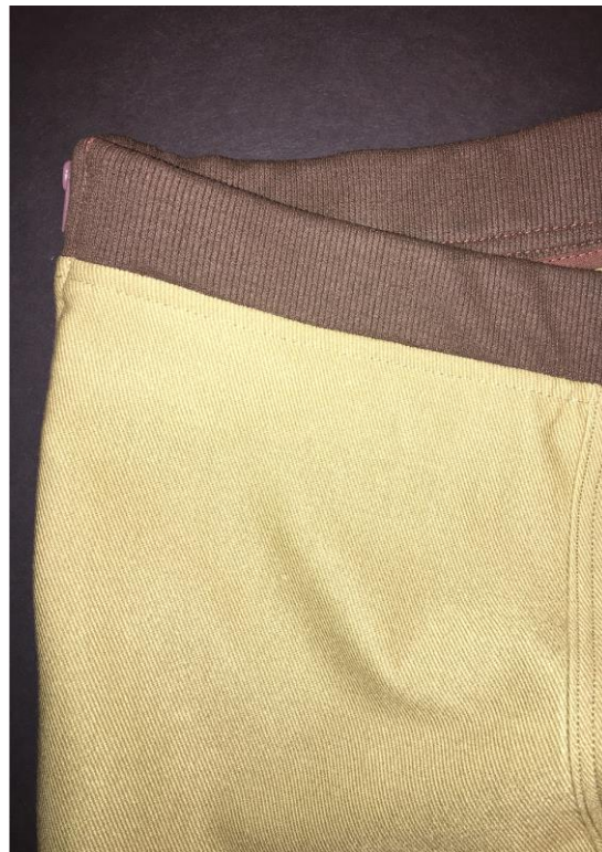
Figure 9. Waist Details