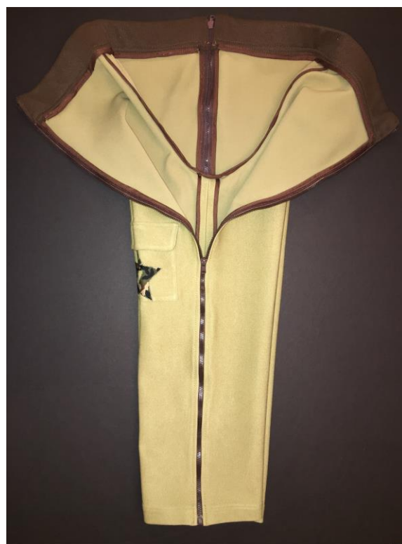
Figure 7. Pant Side Unzipped