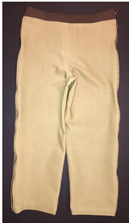
Figure 5. Pant Back