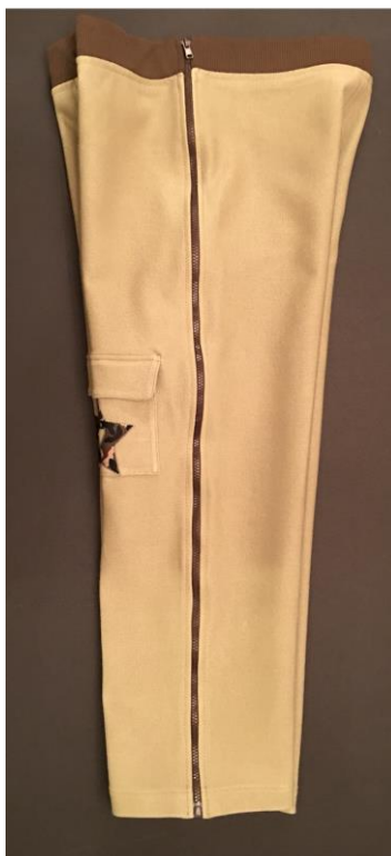
Figure 6. Pant Side Zipped