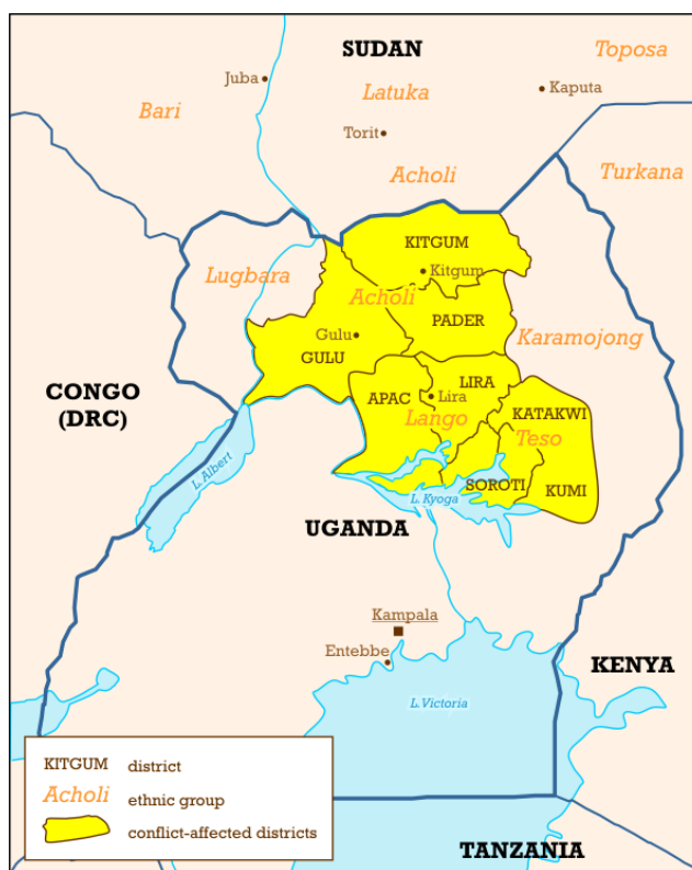
Figure 1 Area affected by LRA

Though Uganda achieved independence from the British in 1962, the country has never enjoyed a significant period of peace. Over the course of its independent history, Uganda has seen every ruler ousted from power by coup or insurgency save one in 1980 who was deposed via fraudulent elections in 1980. After those elections in 1980, Yoweri Museveni, the vice chairman of the Military Commission and leader of the