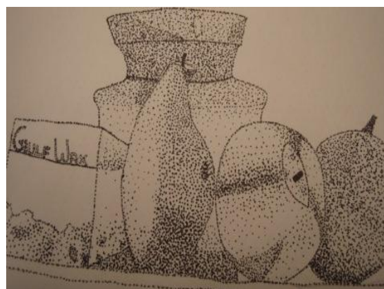
Figure 10 Stippling