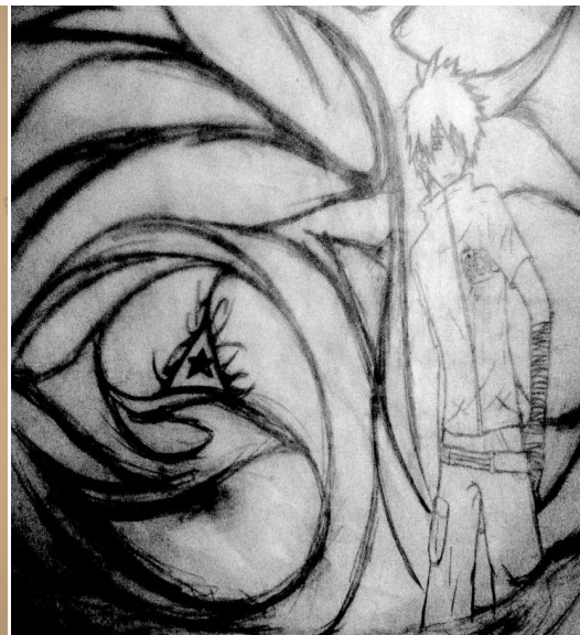
Figure 4 Marcus Week five