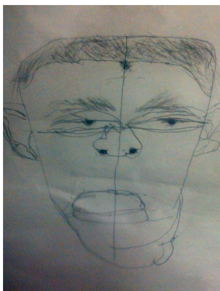
Figure 1 Thomas week five

has been cropped for presentation. There are too many squares on the grid, which appears inconsistent, and serves as a background rather than compartments for the reproduction of the image. The figure appears cartoon-like and reflective of the work one would expect of a much younger student. The corners of the mouth extend the width of the face, the nose is absent, and an arm of the figure is missing. The image floats in the center of the page, and does not display an awareness of space, dimension, composition, and color theory that eighth grade students should acquire as a result of a rigorous art program.