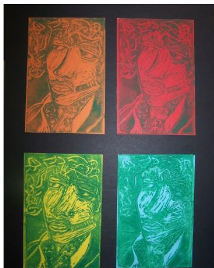
Figure 9 Printmaking

Two-dimensional design is an important aspect of the art program, and there are a myriad of other art processes that can be used to scaffold drawing to make it more interesting to middle school students. For example, projects that incorporate printmaking and stippling interest them because it requires them to layer other techniques onto drawing (See Figures 9 and 10). Therefore, the lack of variety of art processes impeded the level of participation anticipated in the classroom.