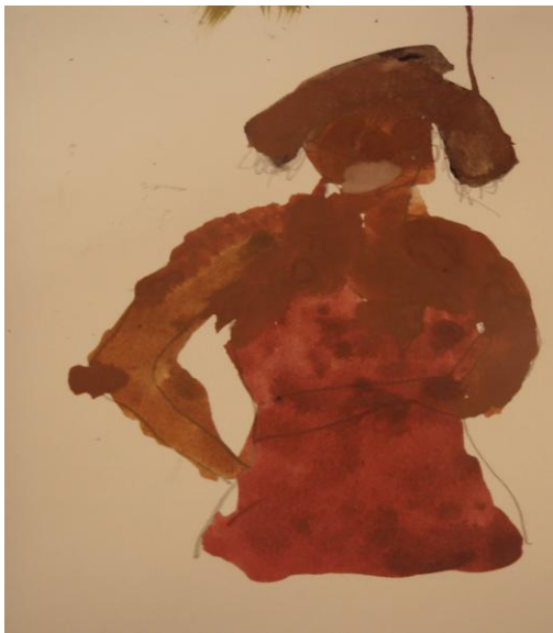
Figure 3 Keenan Week seven

is positioned in the center of the page and floats in the space displaying a lack of understanding of design and space. The figure is incomplete; and colors are flat and devoid of value and tonal quality. The brush strokes are jagged and inconsistent while the face lacks features other than a mouth, which encompasses the lower region. Keenan expressed some puzzlement that his facial features had somehow been erased, however, it is possible that he painted them in a color so close to the skin tone that it blended in once dry. Although it could be argued that well known artists such as Jean Michel Basquiat intentionally painted in a similar style, he also employed a myriad of artistic conventions to create imagery that communicated a message. Conversely, adolescents at this stage in their artistic development struggle to make their work look as representational as possible, and most middle school students lack the sophistication and expressive experiences necessary to make such abstract statements. Keenan's and Thomas' eagerness to learn could have been further compensated through additional guided practice in figure drawing, color theory, and painting.