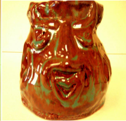
Figure 12 Clay