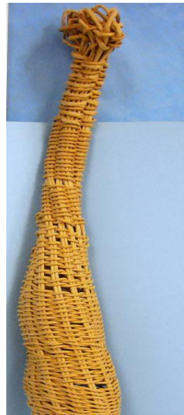
Figure 14 Weaving Paper Core

Heise (2010) suggests that folk art can help students to understand the connection of art to their culture, while also benefiting youth who are academically disengaged. Similarly, in my experience, three-dimensional projects have the capability to motivate even the most reticent students to participate in art class.