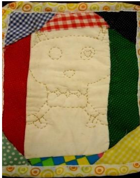
Figure 13 Quilting/Fiber