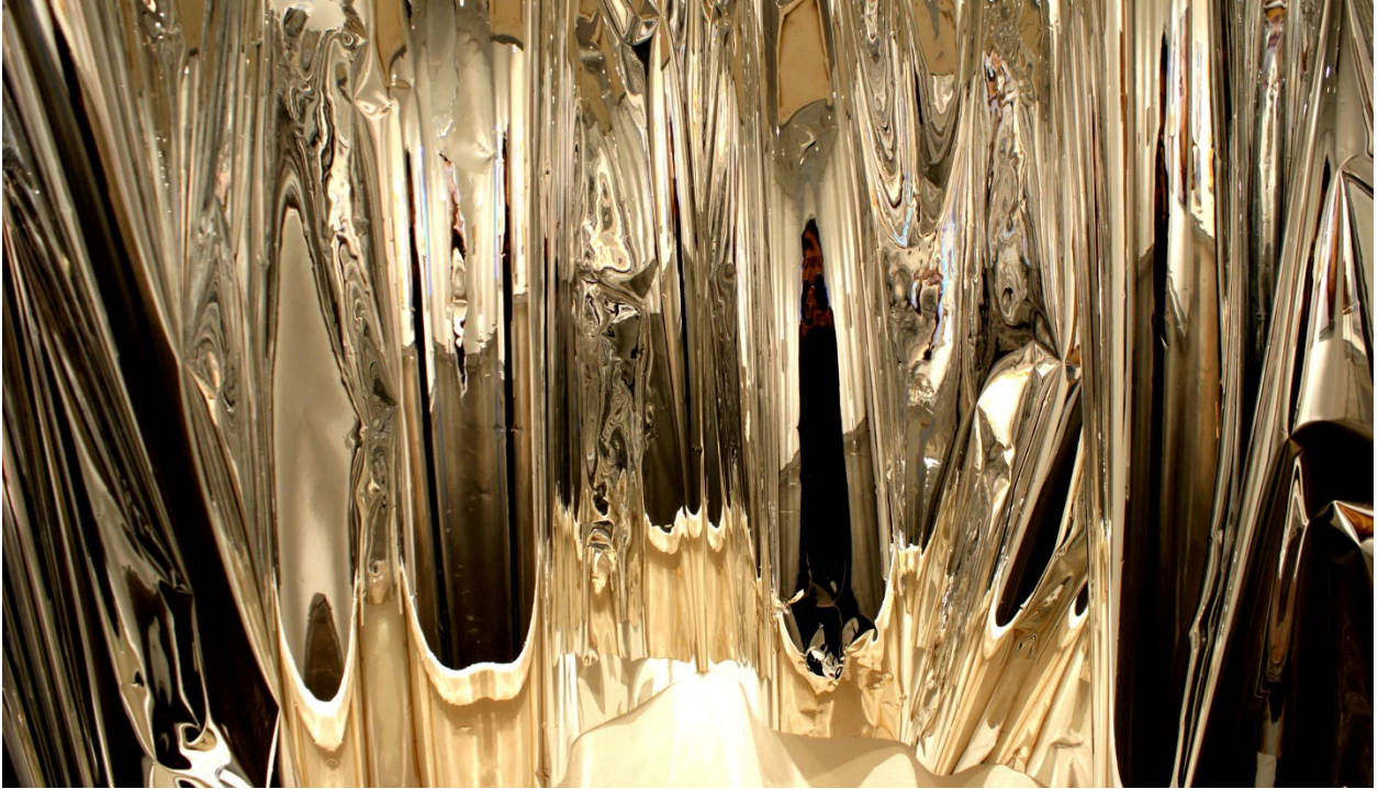
Figure 3: Reflective Mylar on my studio wall.