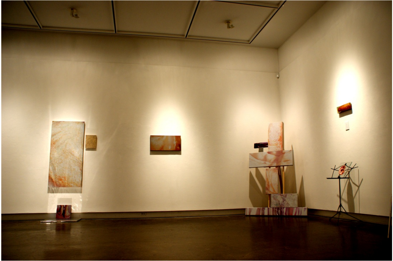
Figure 12: Thesis exhibition view