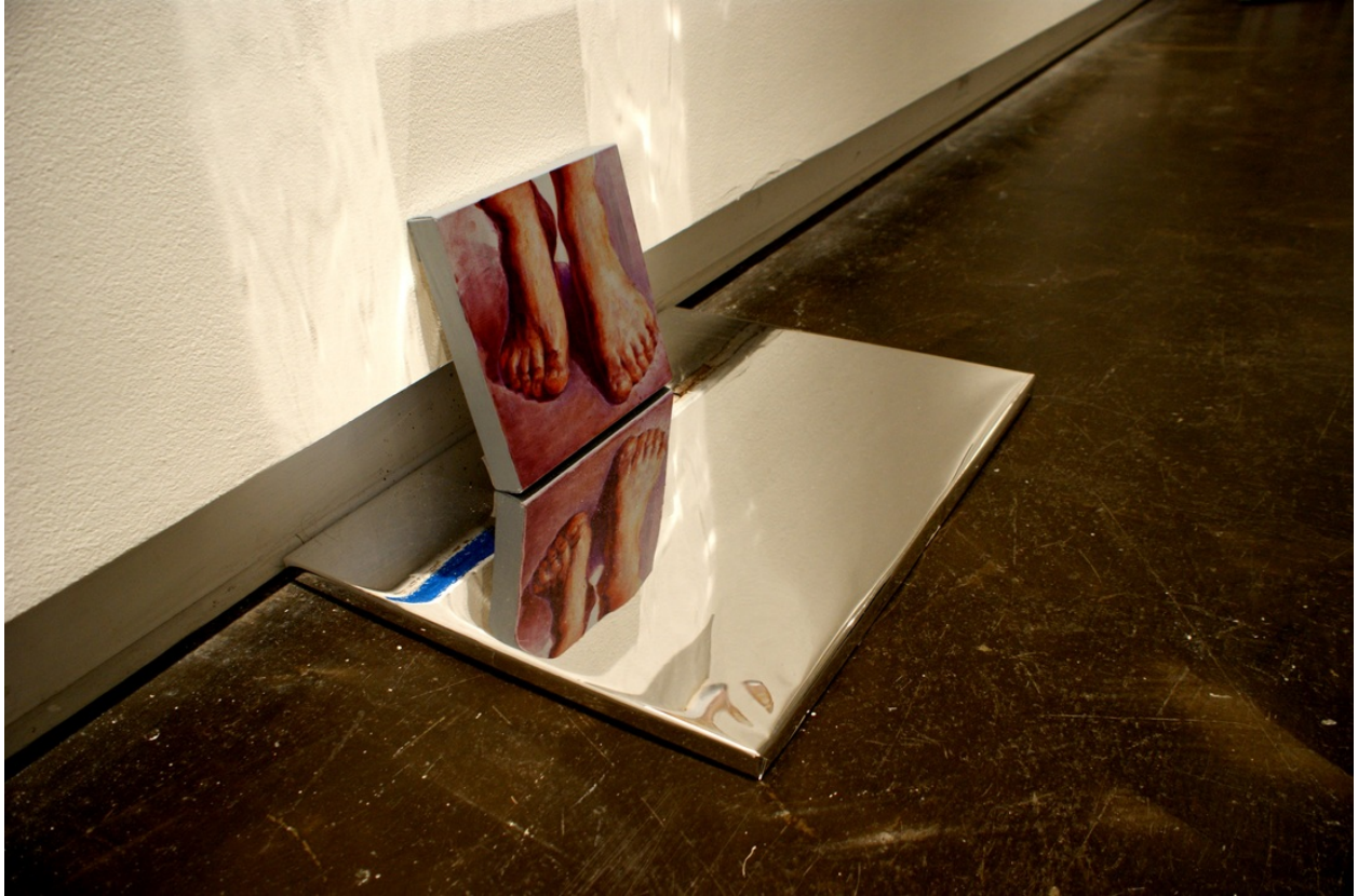
Figure 87: Thesis exhibition view