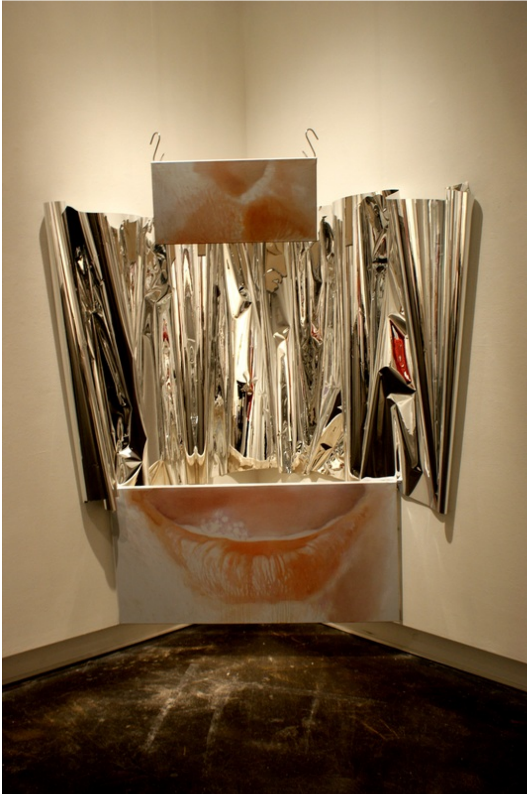
Figure 14: Thesis exhibition view