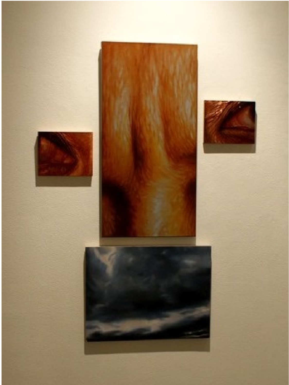
Figure 8: Namwon Choi, Fountains that never run dry , 2014, Oil on canvas, copper and panel, 40X64.