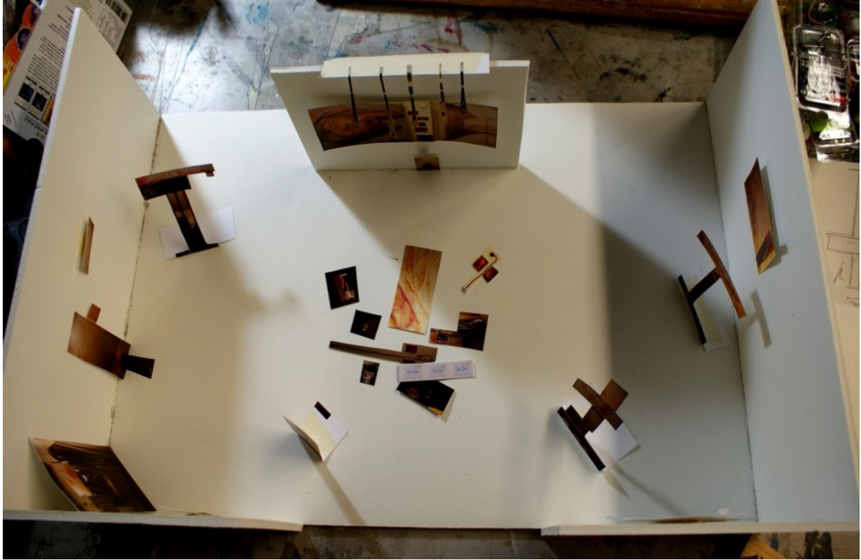
Figure 9: Gallery mockup for my thesis exhibition, 2014.