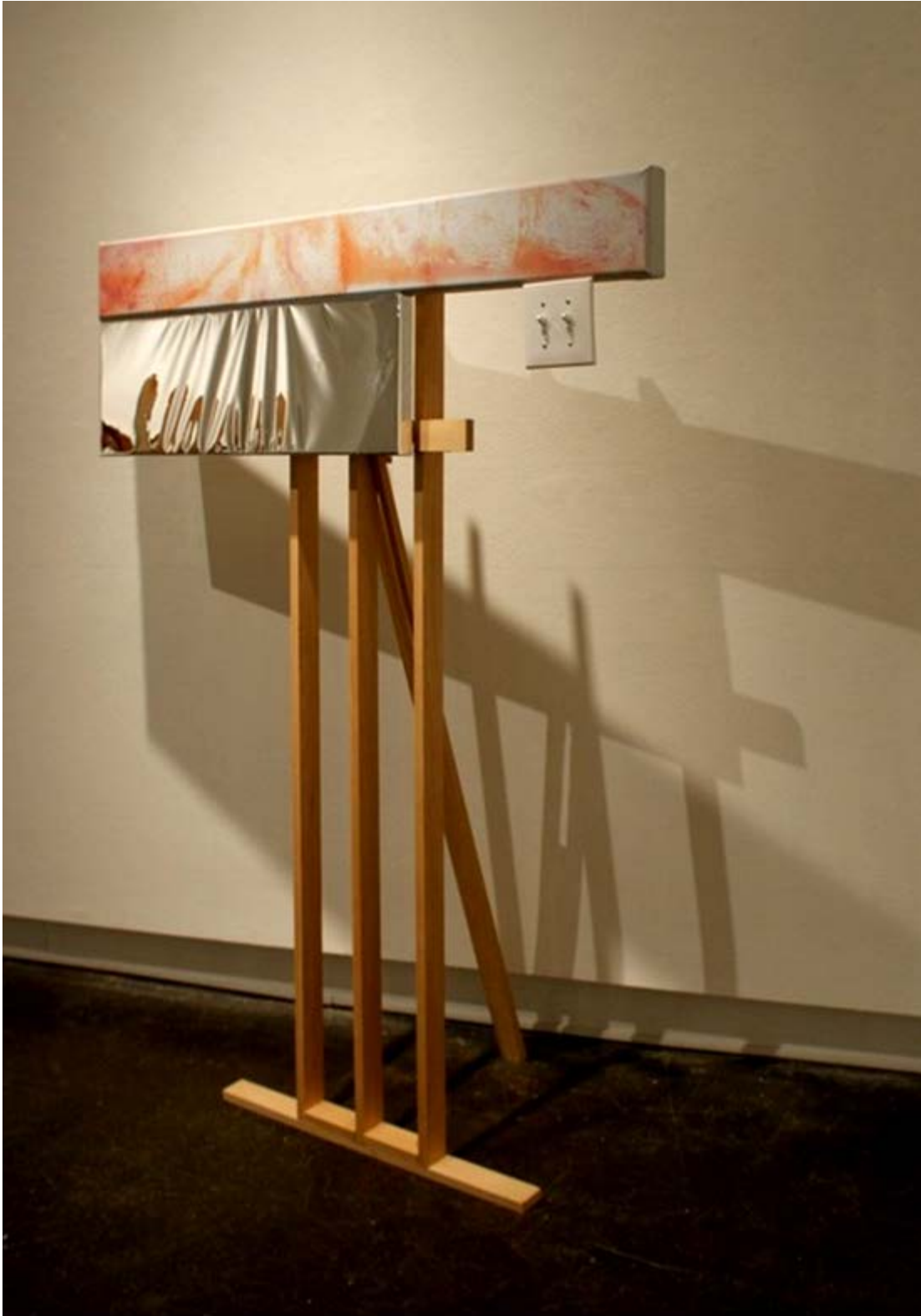
Figure 15: Thesis exhibition view