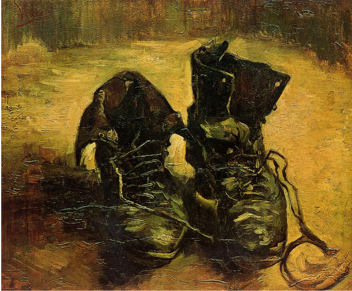
Figure 4: Vincent Van Gogh, A Pair of Shoes, 1886, Oil on canvas, 15X18. Van Gogh Museum, Amsterdam. Van Gogh Museum, http://www.vangoghmuseum.nl (accessed April 19, 2014)