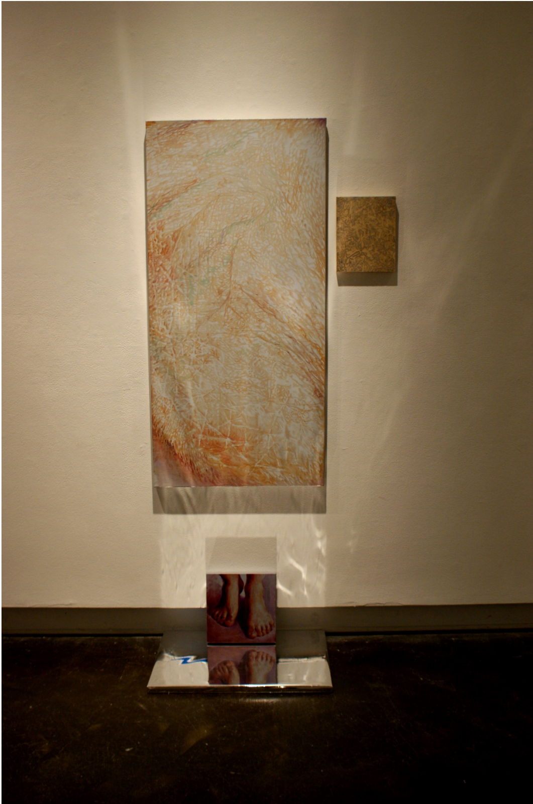
Figure 76: Thesis exhibition view