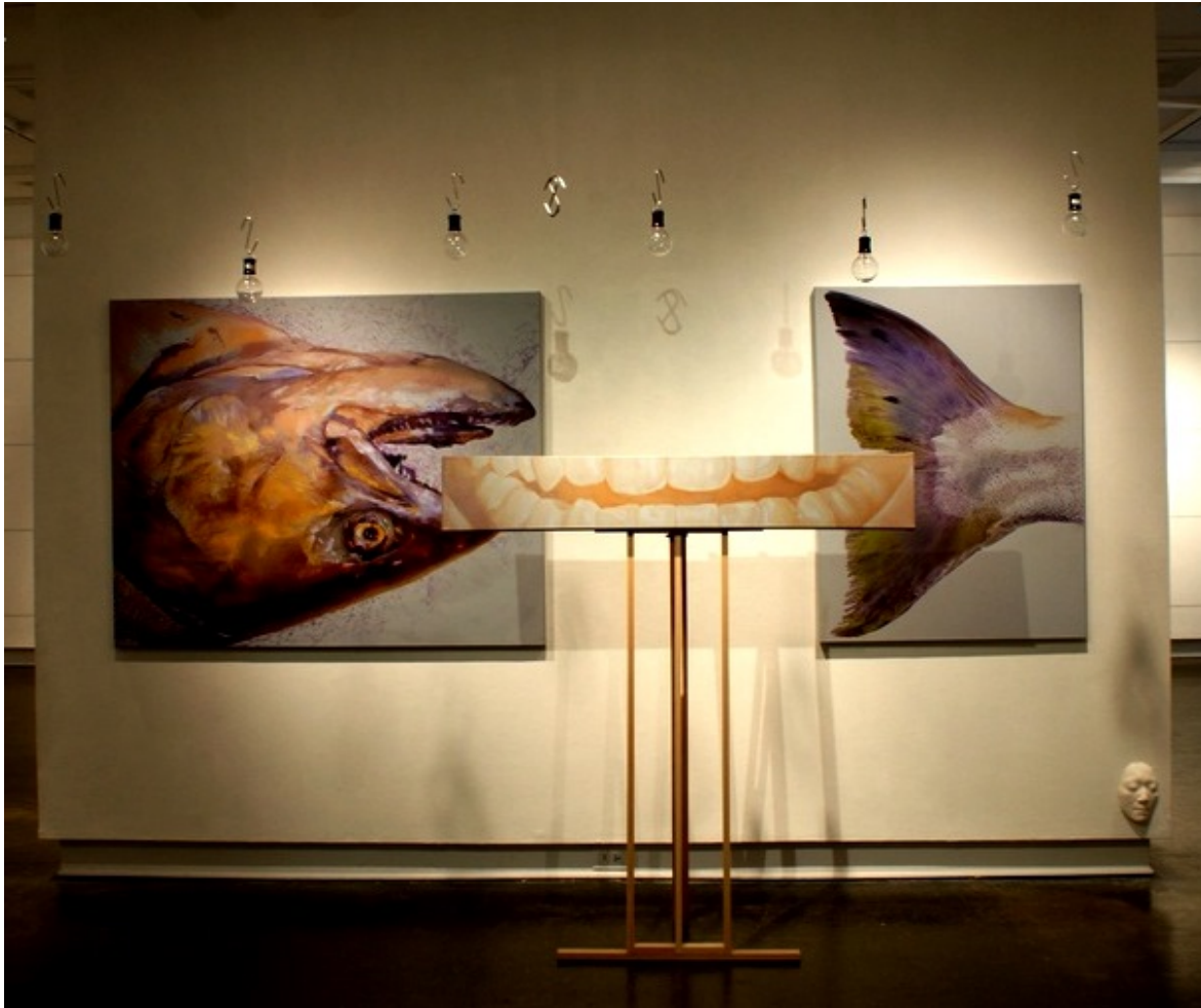
Figure 5: Namwon Choi, Tail bite , 2014, Oil on canvas, light bulbs, hooks, cast mask, easel 153X80, Oil on canvas.