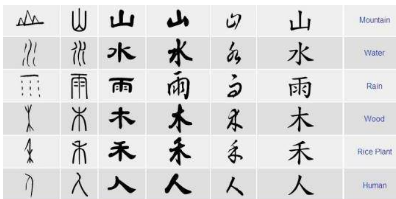
Table 1: Chinese Pictogram 8

Thus, through borrowing the formation of ideograms in Chinese, and the letter placement of Korean, I was able to create a metaphorical self-portraiture of me hoping to continue on my path of artistic creativity (Fig. 7, 8).