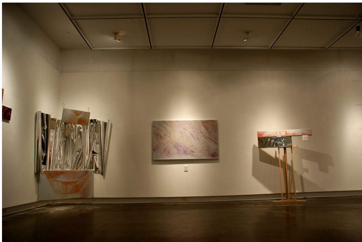
Figure 63: Thesis exhibition view