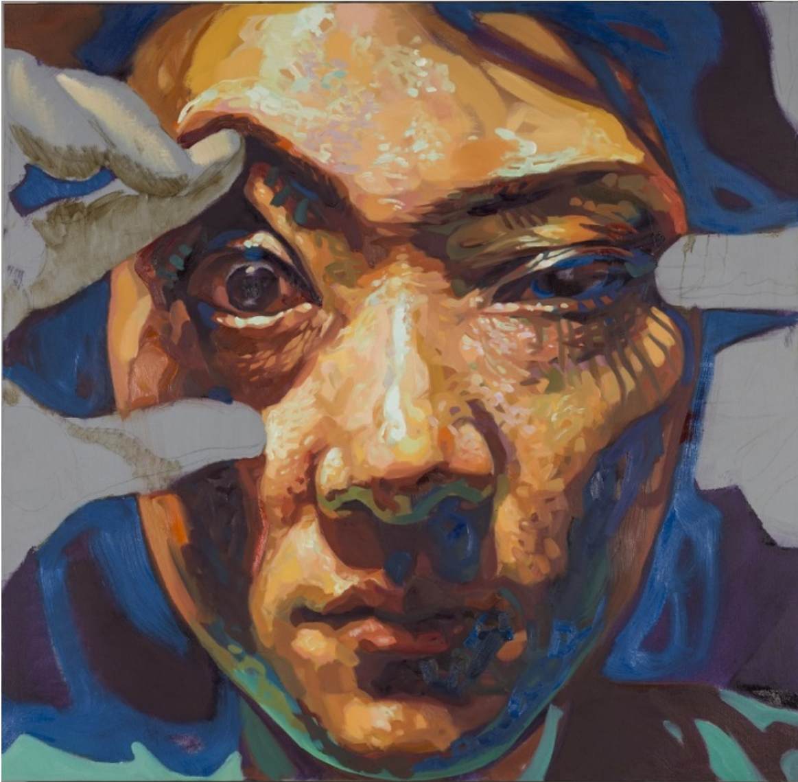
Figure 2. Namwon Choi, Zero Minus , 2013, Oil on canvas, 48X48.