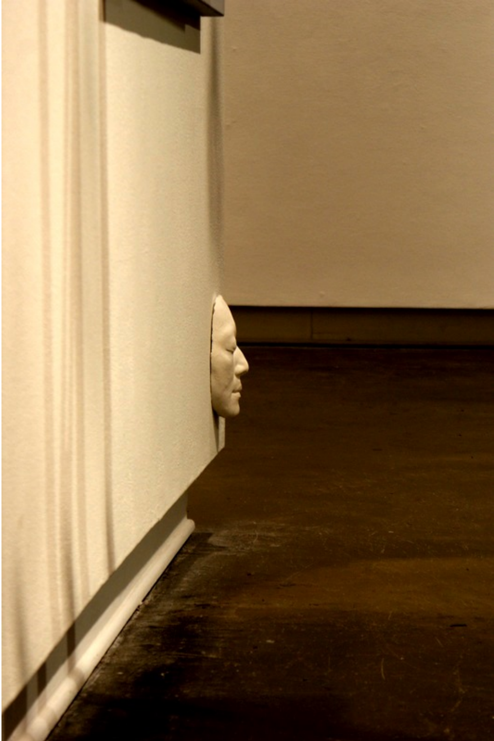
Figure 9: Thesis exhibition view