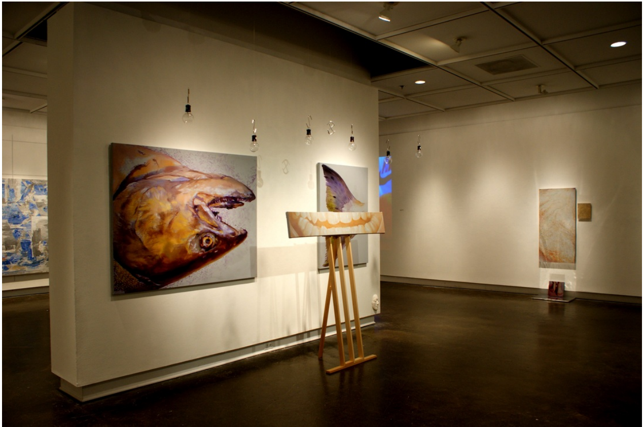
Figure 10: Thesis exhibition view