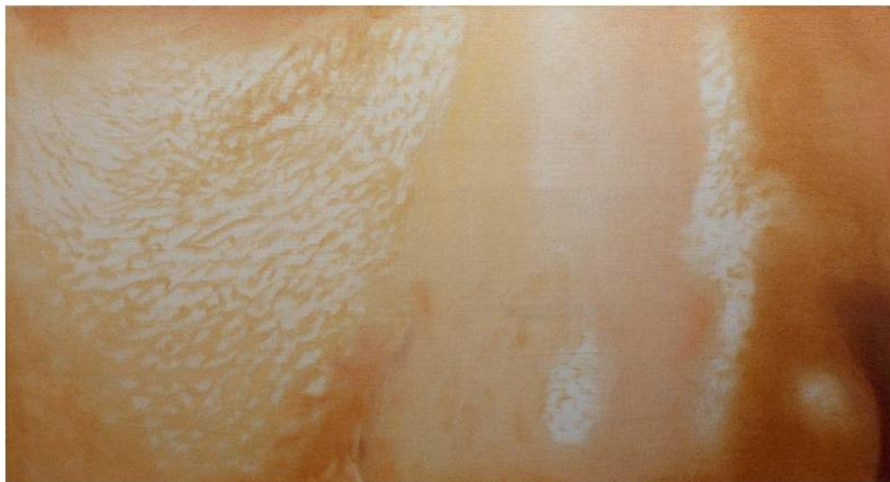
Figure 6: Namwon Choi, Prosperous , 2014, Oil on canvas, 12x24.