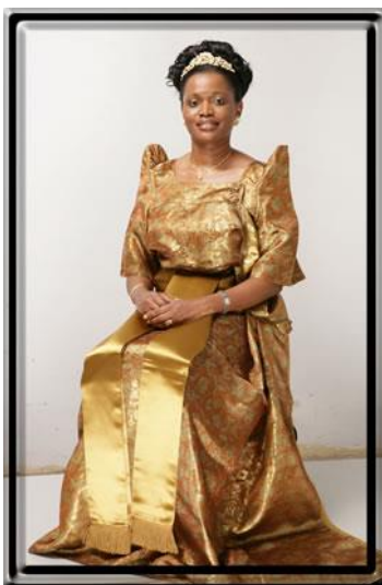
Figure 6 His Majesty Ronald Muwenda Mutebi II, Kabaka of Buganda and (Figure 7) The Nnabagereka (Her Royal Highness, the Queen) Sylvia Nagginda both in traditional costume.