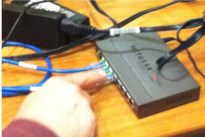
Figure 6 – The switch and cables (one cable per laptop) used to set up a Local Area Network (LAN).

capability to have multiple data enterers enter data into the same system in each country conducting exit screening in real time (see Figures 6-7). The Unit deployed two teams to Liberia and to Sierra Leone in order to first implement the Epi Info version of the database.