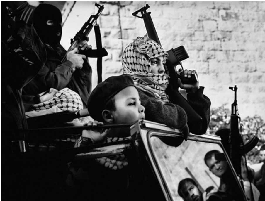
Figure K. Jan Grarup/Noor, Young Fatah members at the funeral of a martyr Young Fatah members at the funeral of a martyr from the City Inn front. The children learn the political views of the adults from an early age. Sep/Nov 2002.