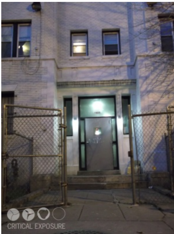
Figure B. Pamela, The truth behind closed doors , Washington D.C., Weed and Seed program, 2013.