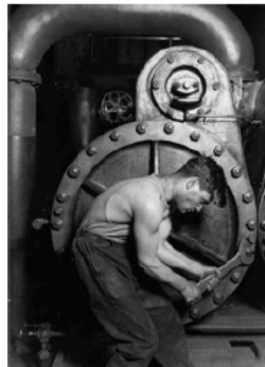
Image by: Lewis Hine, Power house mechanic working on steam pump , courtesy of the National Archives and Records Administration, 1920

The image below is an example of the grueling work that industry was requiring of men during that time. Through his images, Hine was able to expose the gruesome, daunting, even dangerous work men and children were being forced into. Social change was a result of his powerful photographic voice.