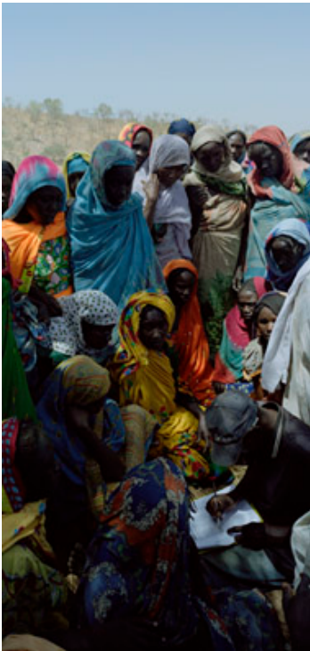
Figure G. Luc Delahaye, Registration of Internally Displaced People in Eastern Chad, negative, May 27, 2006; print, 2007.