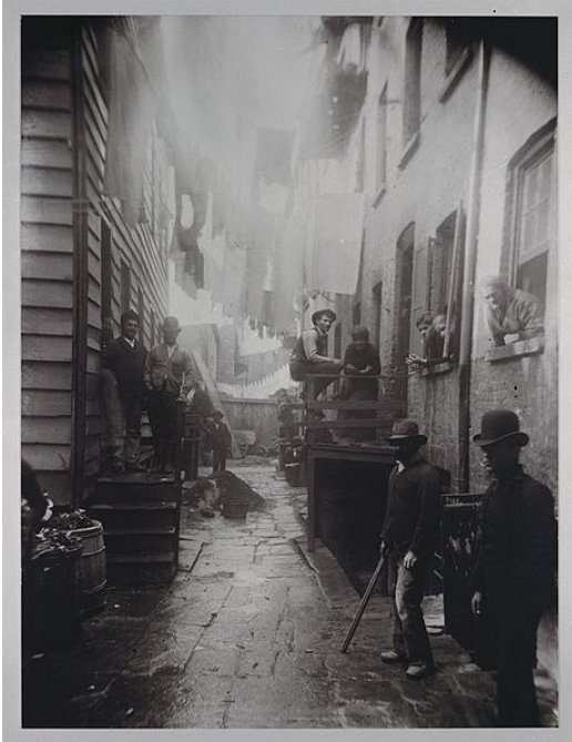
Figure F. Jacob Riis, Bandit's Roost, New York, 1888.