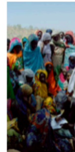
Image by: Luc Delahaye, The Registration of Internally Displaced People in Eastern Chad , negative, May 27, 2006; print, 2007

Delahaye, a contemporary photographer, sought to photograph the "ordinary". He was interested in the long-term implications of world events that goes beyond the initial news feed. His images capture a different vantage point than newspapers or news media portray to citizens. ( Recent History: photographs by Luc Delahaye , 2007). For example, women crowd around an official representative waiting to register for aid at a refugee camp.