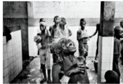
A boy loves the feel of a shower at a care center for homeless children in Kinshasa, capital of the Democratic Republic of the Congo. Thousands of children wander the city's streets, their families destroyed by warfare, AIDS, and poverty. 2005