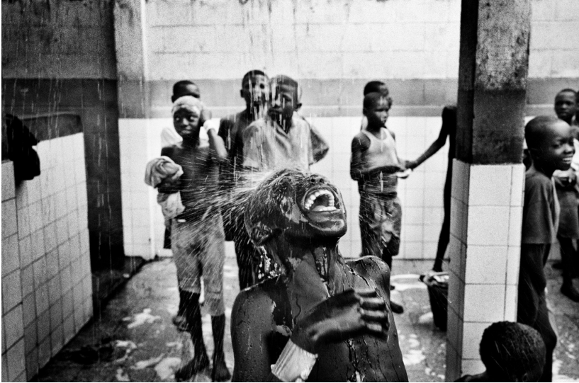
Figure D. Marcus Bleasdale, A boy loves the feel of a shower at a care center for homeless children in Kinshasa, capital of the Democratic Republic of the Congo . Thousands of children wander the city's streets, their families destroyed by warfare, AIDS, and poverty, Republic of Congo, 2005.