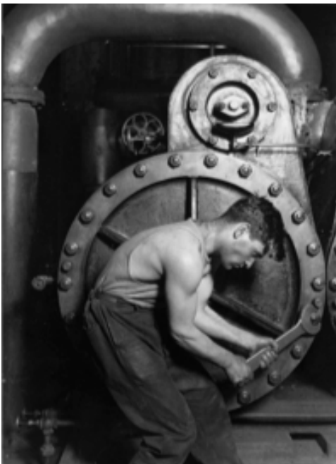
Figure I. Lewis Hine, Powerhouse mechanic working on steam pump , courtesy of the National Archives and Records Administration, 1920.