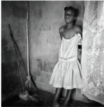
Image by: Gigi Cohen, Haiti-domestic service, The Photo Project, n.d.

Child Labor and the Global Village: Photography for Social Change is a collective of 11 photographers who's goal is to move people emotionally and to motivate people to action through viewing their photographs about child workers. The collective body of work travels around the world visiting places like Congress, schools, and universities. The organization wants to bring child labor to the attention of citizens to inspire compassion. Many of the future workers will come from developing countries where they have been injured or harmed at an early age.