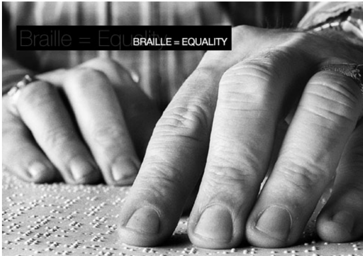
Figure A. Bernard Weil, Braille=equality , n.d.