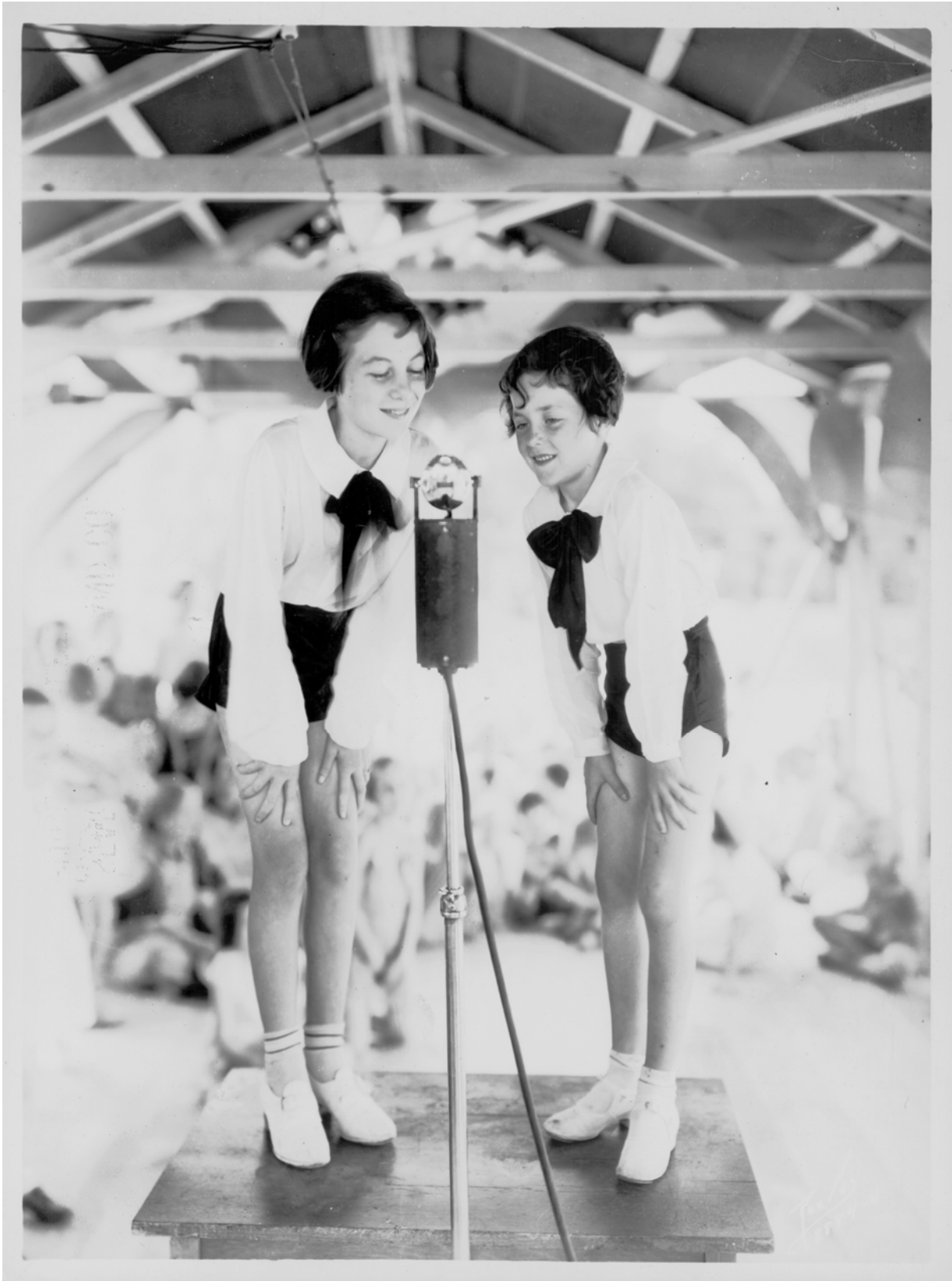
Figure 6: Sears Atlanta Farmers' Market Mid-Summer Farm Festival, circa 1931.