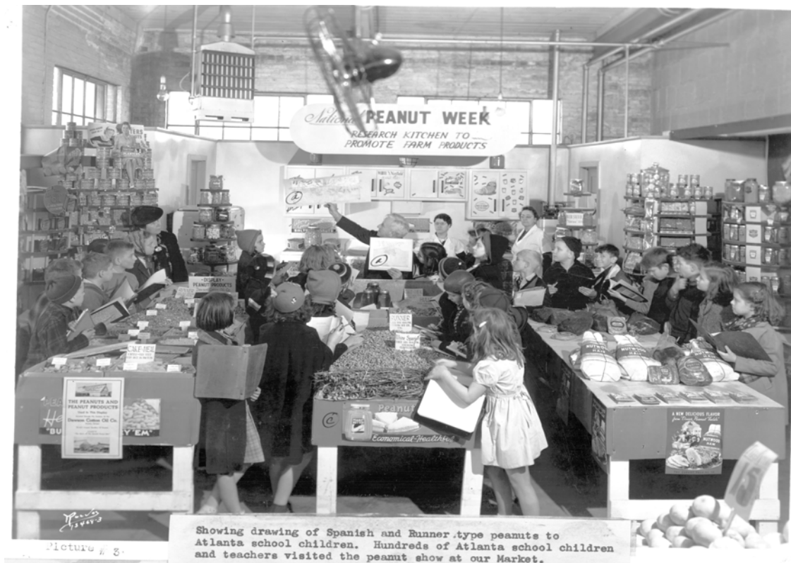
Figure 11: Sears Atlanta Farmers' Market National Peanut Week presentation for Atlanta school children, circa 1945.