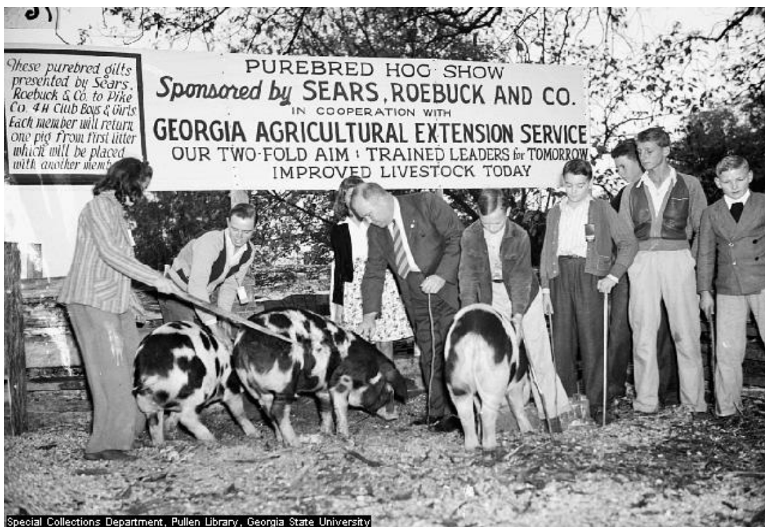
Figure 12: Pike County Georgia 4-H Purebred Hog Show sponsored by Sears, Roebuck & Co., circa 1941.