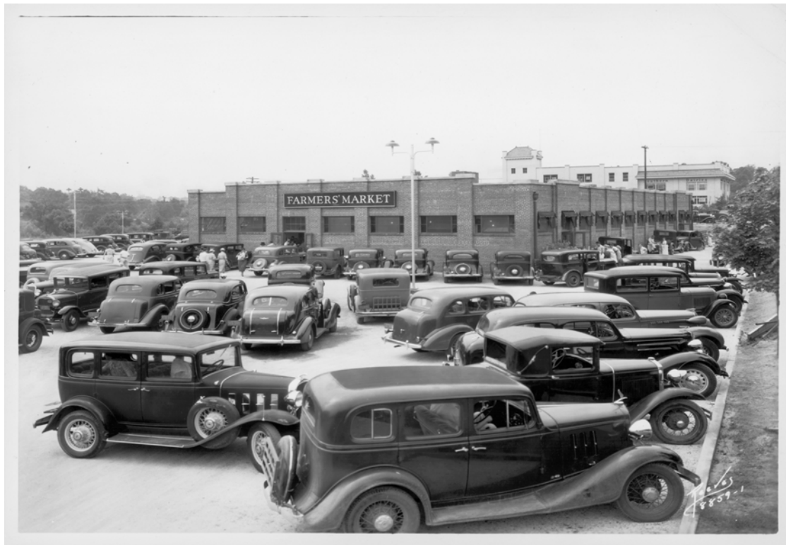
Figure 4: Sears Atlanta Farmers' Market exterior, circa 1931.