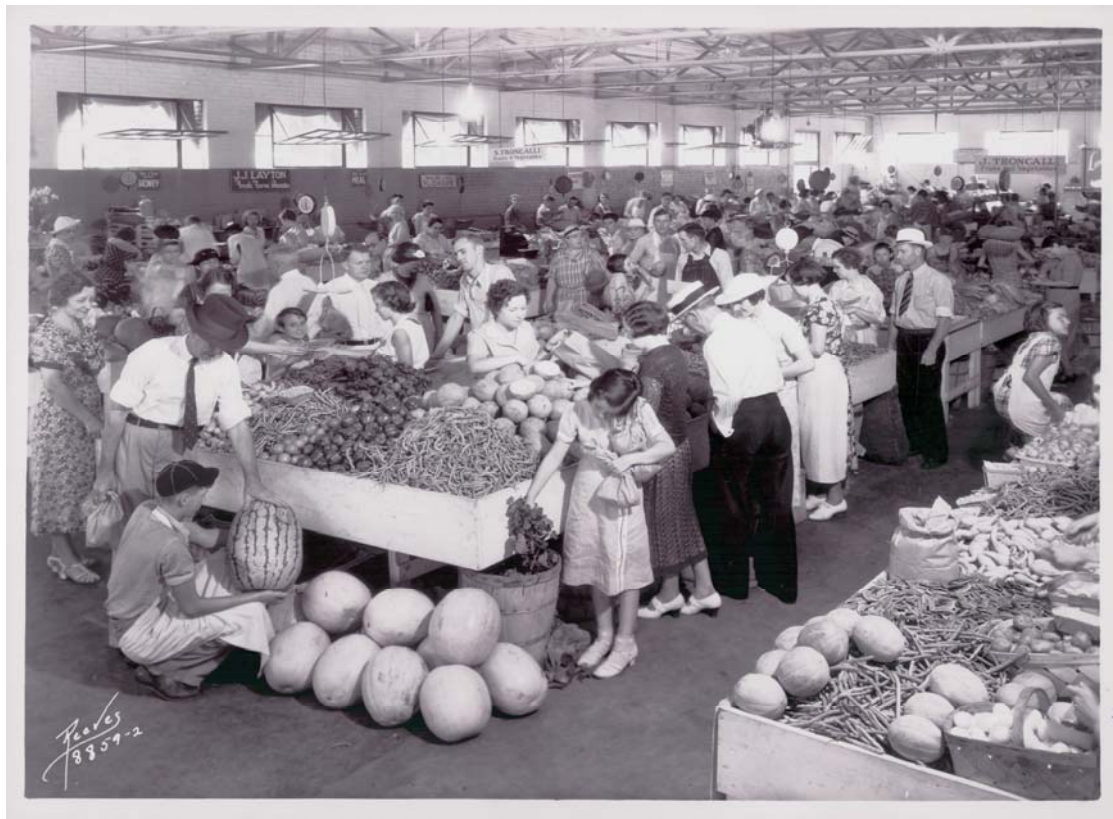
Figure 5: Sears Atlanta Farmers' Market interior, circa 1931.