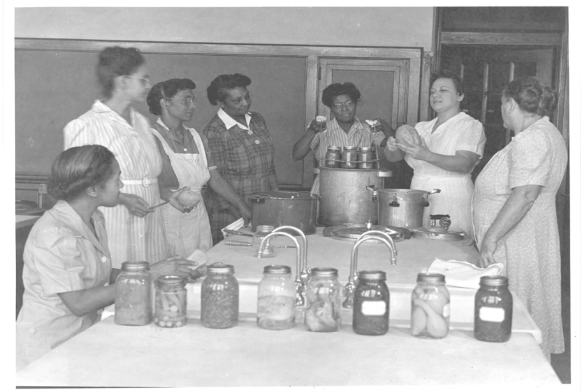
Figure 10: Sears Atlanta Farmers' Market segregated home canning demonstrations, circa 1945.

The Market sponsored a canning and gardening contest for Atlanta negro women, too.