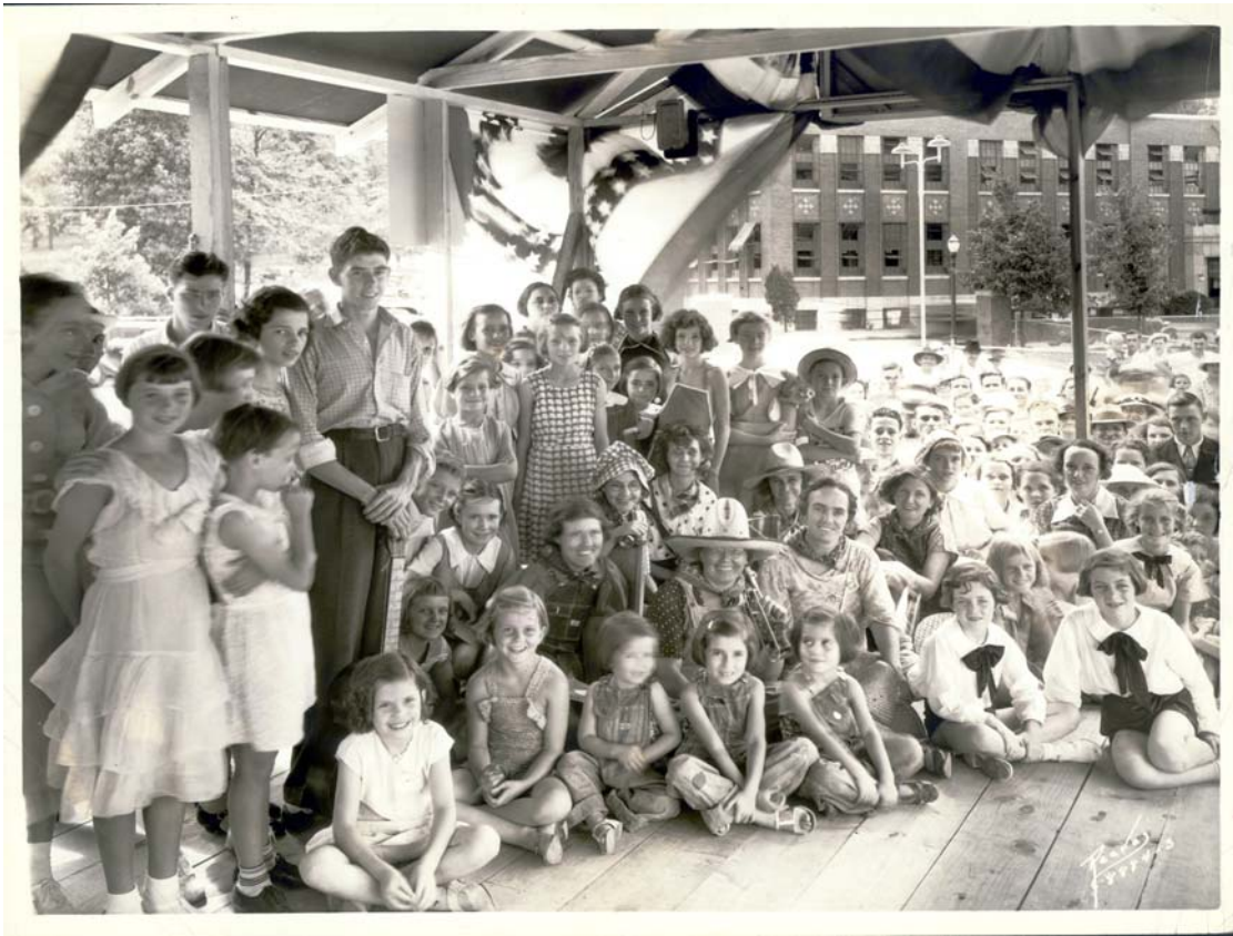
Figure 7: Farmers' Market Mid-Summer Farm Festival, circa 1931.