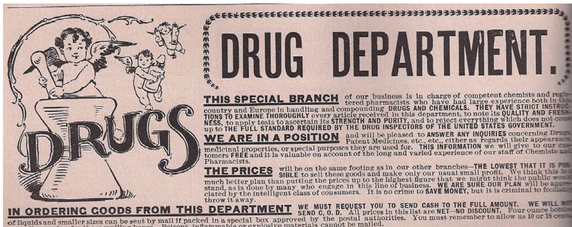
Figure 2: First page (pg. 26) of the drugs / patent medicines section found in the 1897 catalog No. 104.