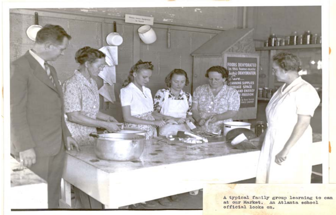
Figure 9: Sears Atlanta Farmers' Market segregated home canning demonstrations, circa 1945.

The Market sponsored a canning and gardening contest for Atlanta negro women, too.